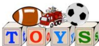
A Safe Place Collection