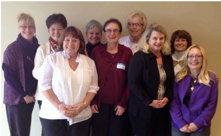
Happy guests and new members at the New Members' Tea on October 23.