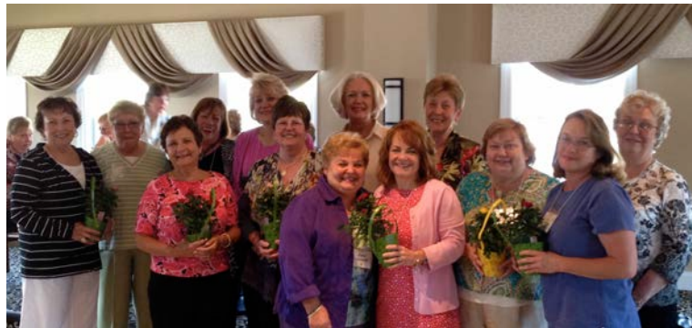
New members are welcomed at the Closing Lunch.