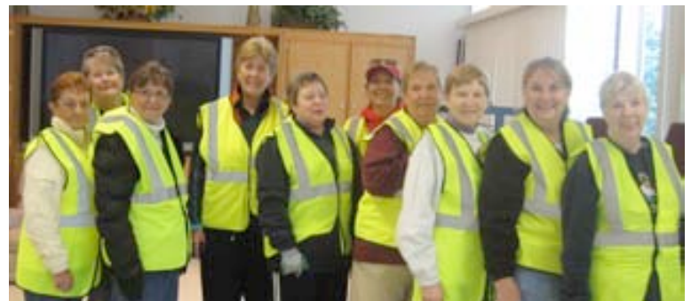
The AWC Fall Clean-Up Crew: Ready to work!

November 15th is "America Recycles Day" which is part of the Keep America Beautiful Program. Please be sure you are recycling and encourage others to do so too. A great resource for this is the Solid Waste Agency of Lake County at SWALCO.org or 847-336-9340. We can all make a difference!