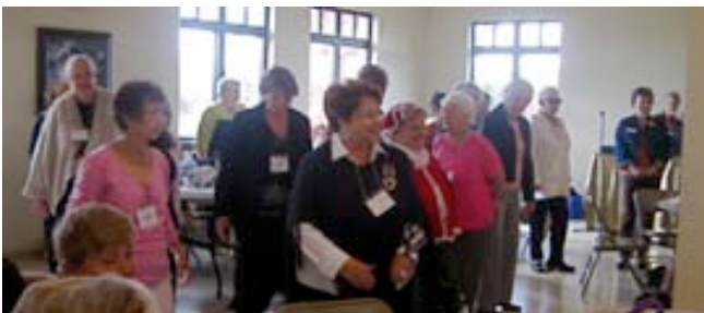
Club members got happy feet during the musical program at the October meeting.